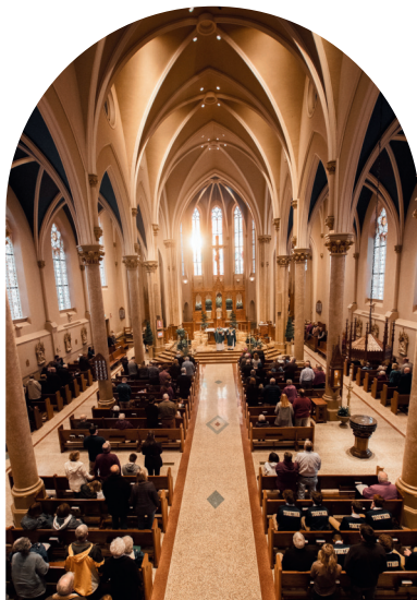
4 PM Mass Blessing of Married Couples