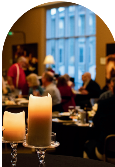
5 PM Hors d'oeuvres & 4-Course Dinner